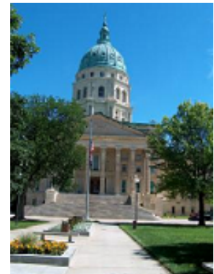
Kansas Capitol, site of the opening ceremony