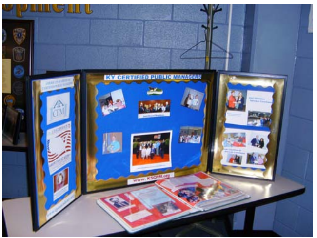
KSCPM Display & Historical Scrapbook