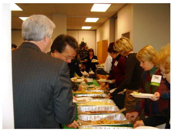
Members enjoy lunch