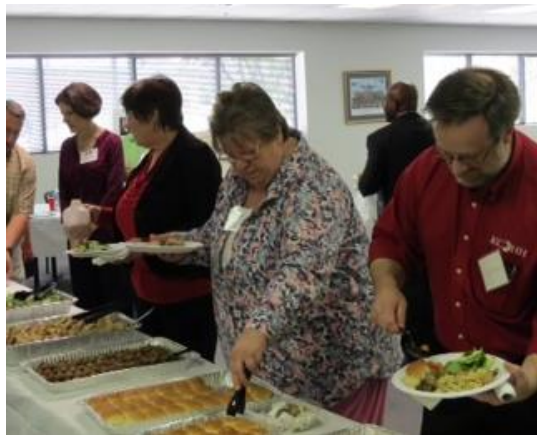
Lunch is served!