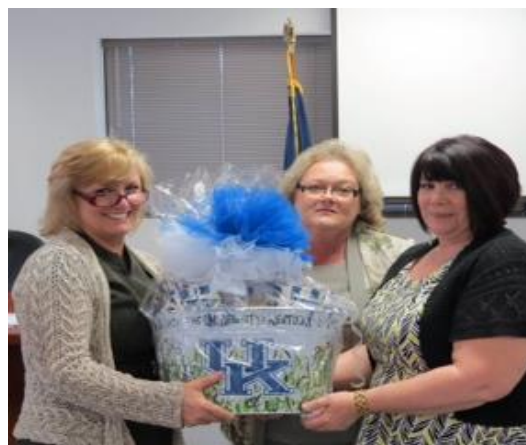
Door prizes! Always the best part of the day!